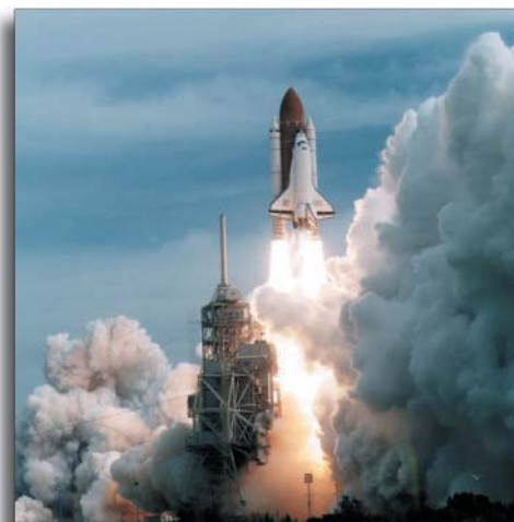
Our dataloggers collected data for a structural joint damping experiment aboard the Space Shuttle Endeavor (STS-69).