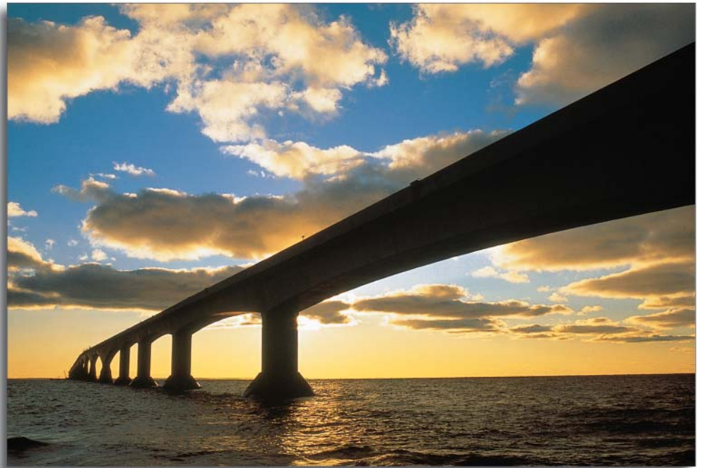
Campbell Scientific data acquisition systems make reliable structural measurements, even in harsh, remote environments. The 13 km Confederation Bridge that connects Prince Edward Island with mainland Canada was instrumented to document strain during ice impacts and to observe weather.

Campbell Scientific data acquisition systems' versatile capabilities make them ideal for structural and seismic monitoring. Our dataloggers have been used in applications ranging from simple beam fatigue analysis, to structural mechanics research, to continuous monitoring of large, complex structures. Highway overpasses, roads, buildings, bridges, retaining walls, and amusement park rides are the types of structures for which our systems provide remote, unattended, and portable monitoring. Our data acquisition systems are known for making accurate, reliable measurements, even in harsh environments.